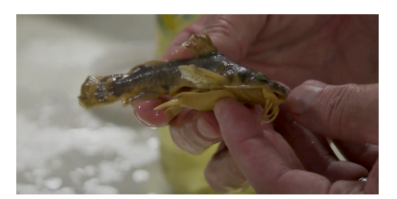
C. Cool Down